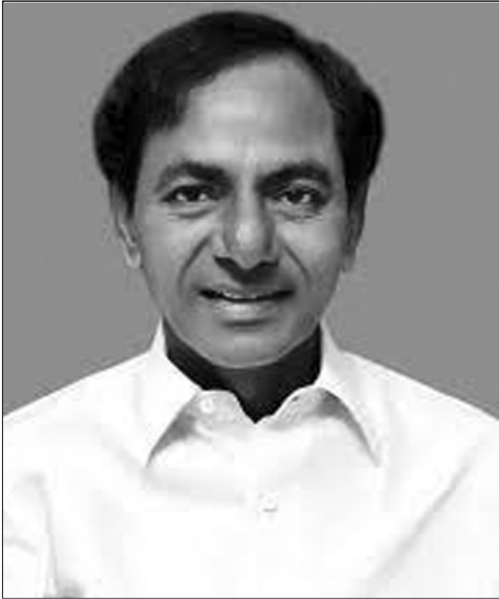
Sri. K. Chandrashekhara Reddy Hon'ble Chief Minister of Telangana